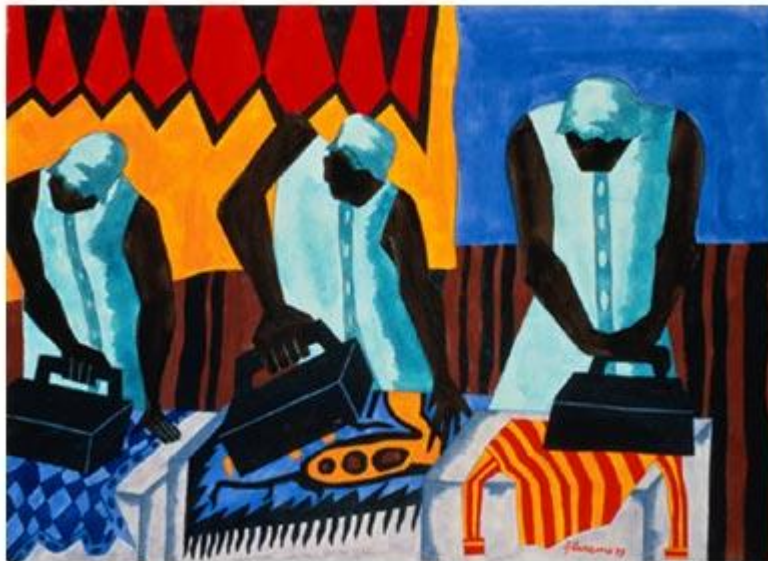
Jacob Lawrence, "The Seamstress," 1946

The emergence of the market in labour power required the dissolution of the reference groups [that are the primary source of our conceptions of 'the Good,' of our most important moral values and principles], so that one subject came to face another no longer within the web of norms presented by the sharing of various reference groups. Instead, one subject came to face another solely as competitor in the market to supply Capital with labour power necessary for the maximisation of profit. Capital needs labour power to be freed from the normative bonds of our actual traditions, or else its supply will be economically inefficient. And of course, for Capital, the only measure of the adequacy of its supply is the economic efficiency in terms of profit maximisation. [...] Capitalism cannot abide the construction of relationships other than those economic ones in which it places one labourer in relation with another. [...] For capitalism to flourish, moral agency must be replaced by economic agency and therefore it is no good trying to put a 'human' face upon capitalism. As long as the underlying economic arrangement is a capitalist one, there is no room for the construction of the reference groups required to make that face more than a shallow mask. —Michael Luntley in The Meaning of Socialism (1990)