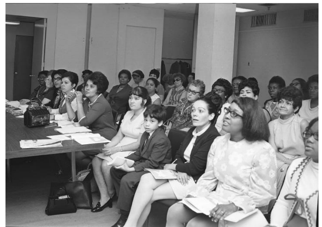
Paraprofessionals taking a high-school equivalency exam, Manhattan, 1970. The UFT's landmark paraprofessional contract created opportunities for education and advancement for thousands of working-class women.