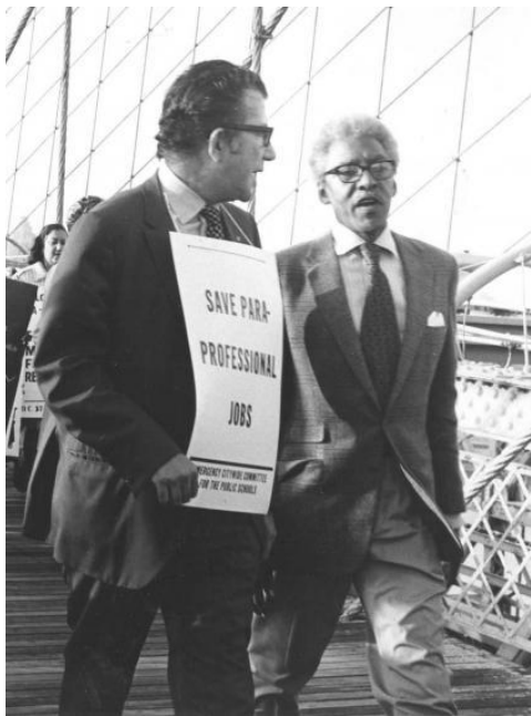
Albert Shanker and Bayard Rustin march in support of collective bargaining rights for paraprofessionals. October 6, 1970.