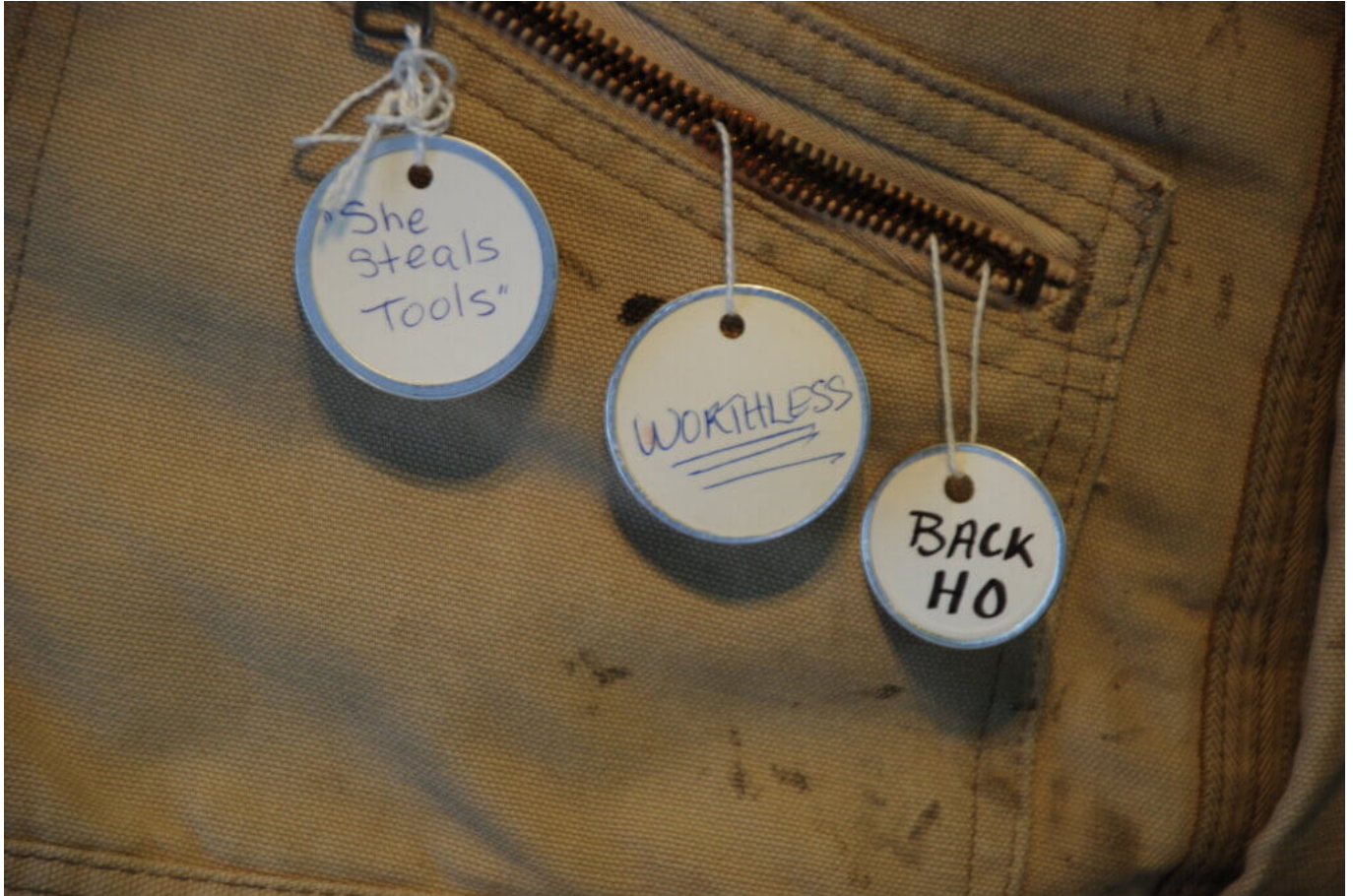
From the website exhibit.