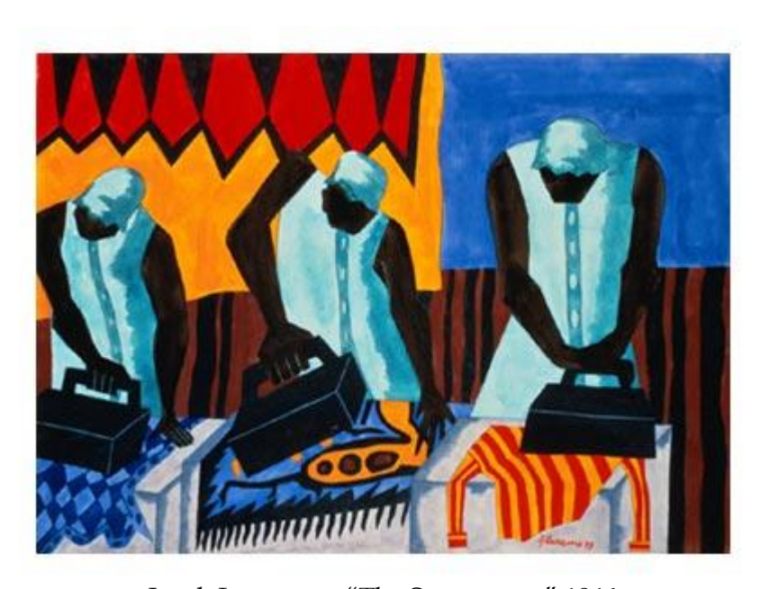
Jacob Lawrence, "The Seamstress," 1946

The emergence of the market in labour power required the dissolution of the reference groups [that are the primary source of our conceptions of 'the Good,' of our most important moral values and principles], so that one subject came to face another no longer within the web of norms presented by the sharing of various reference groups. Instead, one subject came to face another solely as competitor in the market to supply Capital with labour power necessary for the maximisation of profit. Capital needs labour power to be freed from the normative bonds of our actual traditions, or else its supply will be economically inefficient. And of course, for Capital, the only measure of the adequacy of its supply is the economic efficiency in terms of profit maximisation. [....] Capitalism cannot abide the construction of relationships other than those economic ones in which it places one labourer in relation with another. [....] For capitalism to flourish, moral agency must be replaced by economic agency and therefore it is no good trying to put a 'human' face upon capitalism. As long as the underlying economic arrangement is a capitalist one, there is no room for the construction of the reference groups required to make that face more than a shallow mask.—Michael Luntley in The Meaning of Socialism (1990)