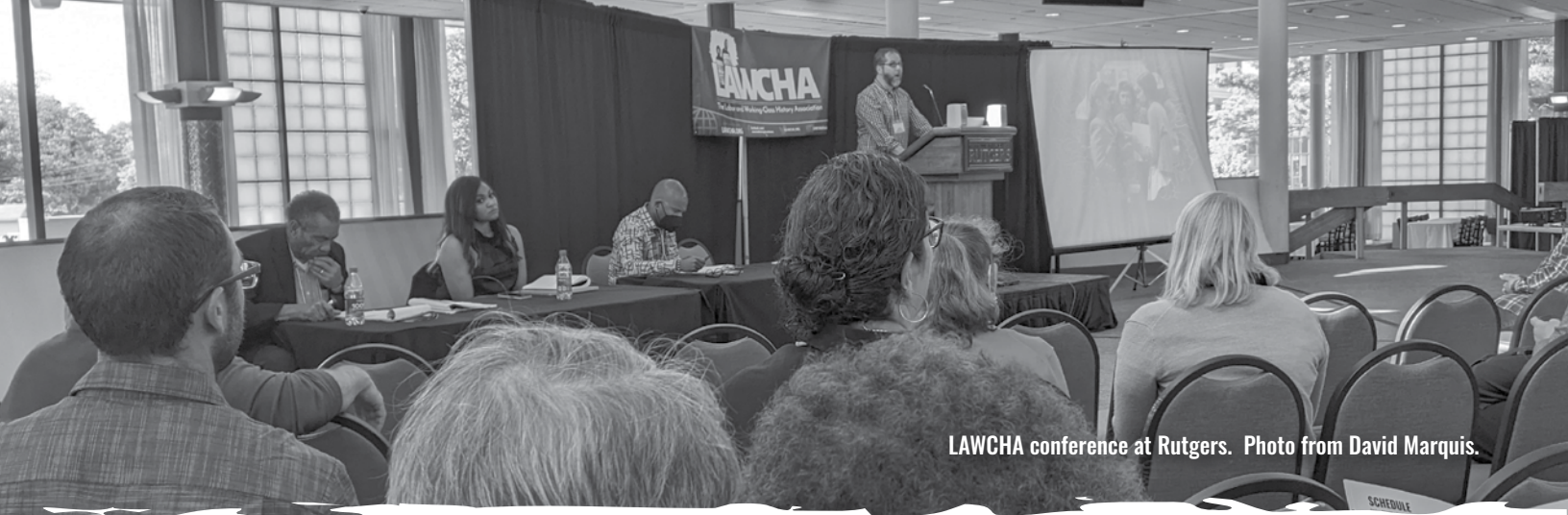
LAWCHA conference at Rutgers.