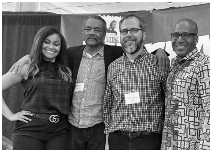
LAWCHA 2023 Conference attendees at Rutgers University.