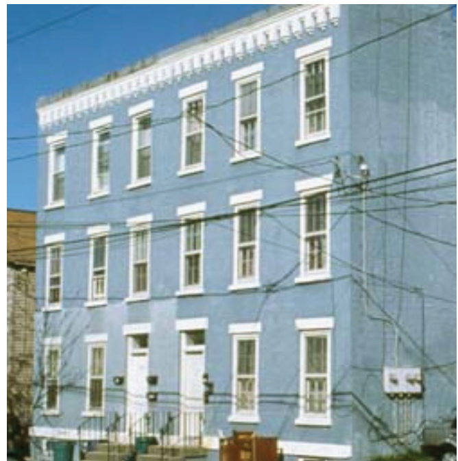
Kate Mullany House where the American Labor Studies Center is housed in Troy, NY