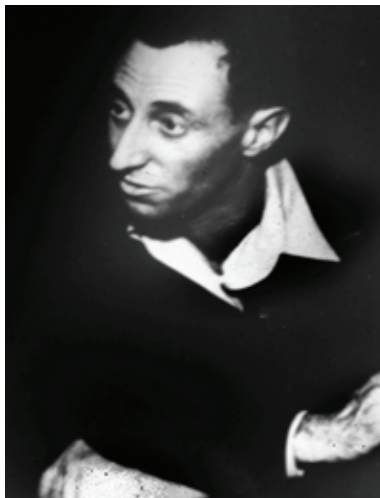
Young Harry Bridges

Harry Bridges, an Australian seaman, led the historic San Francisco waterfront strike of 1934 that unionized the docks. Police killed two strikers during one of the few successful general strikes in U.S. labor history. Bridges went on to lead the Congress of Industrial Organizations on the West Coast. For his pains, the U.S. government spent twenty years and held three different inquests trying to deport him as an "alien" radical. Bridges refused to name names or recant his Marxist beliefs. He went on to denounce the internment of Japanese Americans during World War II, to marry a Japanese-American in defiance of miscegenation laws banning interracial marriage, and to demand equal rights for African Americans